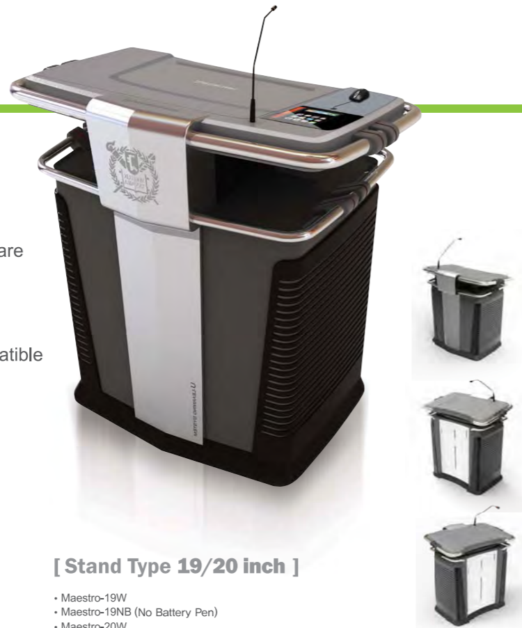
[ Stand Type 19/20 inch ]

ISO 9001 Quality Management System ISO 14001 Environmental Management System