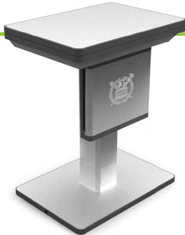
[ Stand Type 22 inch ]

ISO 9001 Quality Management System ISO 14001 Environmental Management System