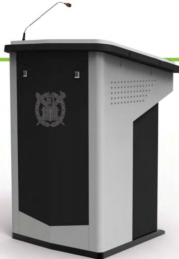
[ Stand Type 19/22 inch ]