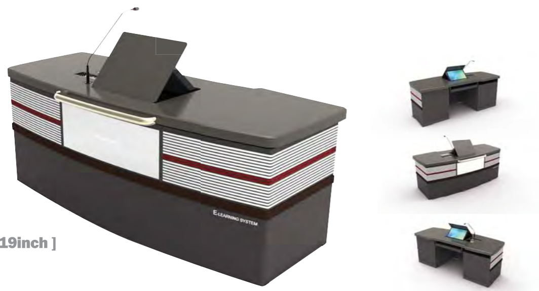
[ Seat Type 19inch ]